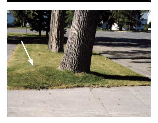
Figure 7. The mound (arrow) at the base of this tree indicates that the tree has recently begun to lean, and may soon fail.

• Advanced decay is present in the root flares or "buttress" roots.