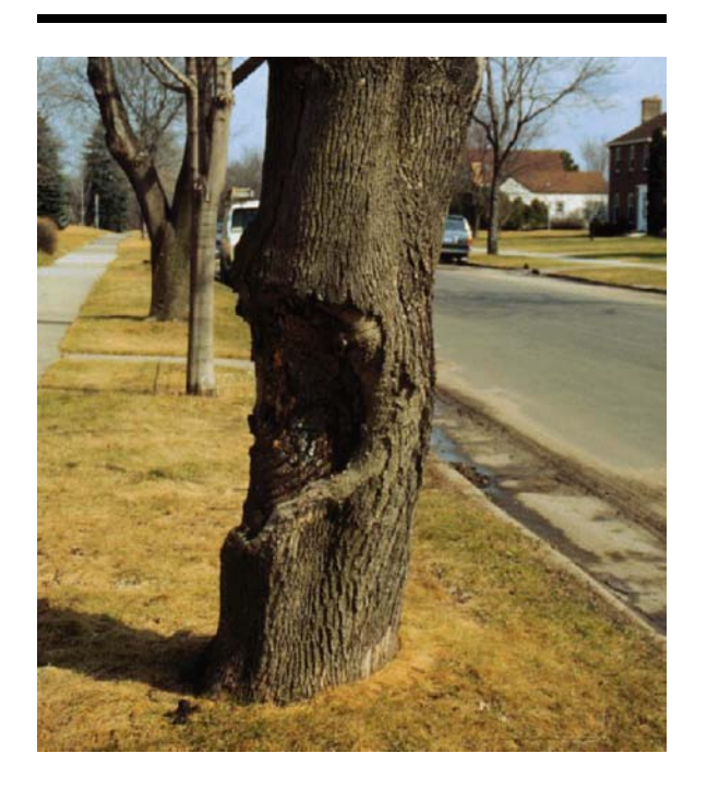
Figure 5. The large canker on this tree has seriously weakened the stem.

• A canker is physically connected to a crack, weak branch union, a cavity, or other defect.