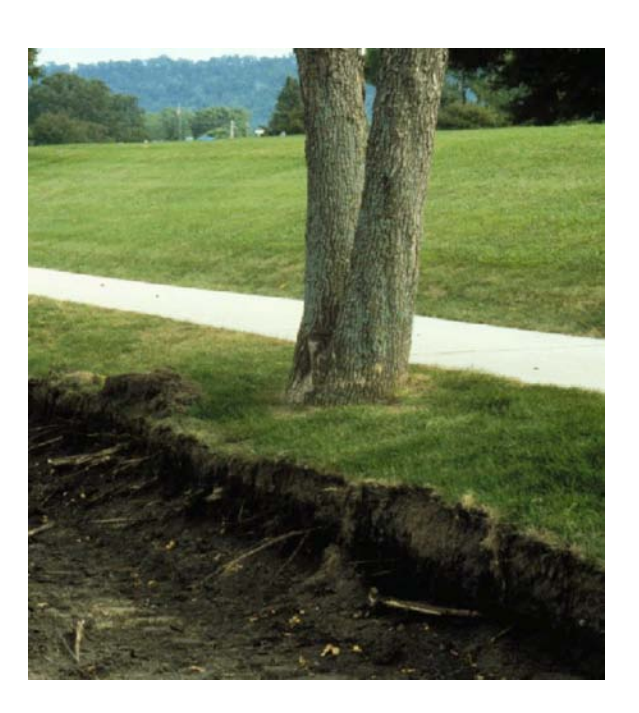
Figure 6. Severing roots decreases support and increases the chance of failure or death of the tree.

than normal leaves are symptoms often associated with root problems. Because most defective roots are underground and out of sight, aboveground symptoms may serve as the best warning.