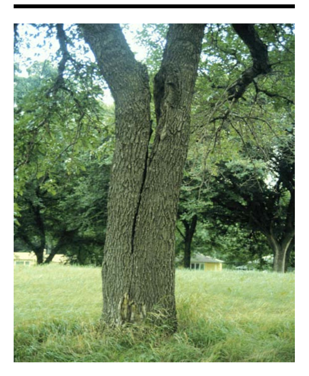
Figure 3. This weak branch union has failed, creating a highly hazardous situation.

act as a wedge and force the branch union to split apart. Trees with a tendency to form upright branches, such as elm and maple, often produce weak branch unions.