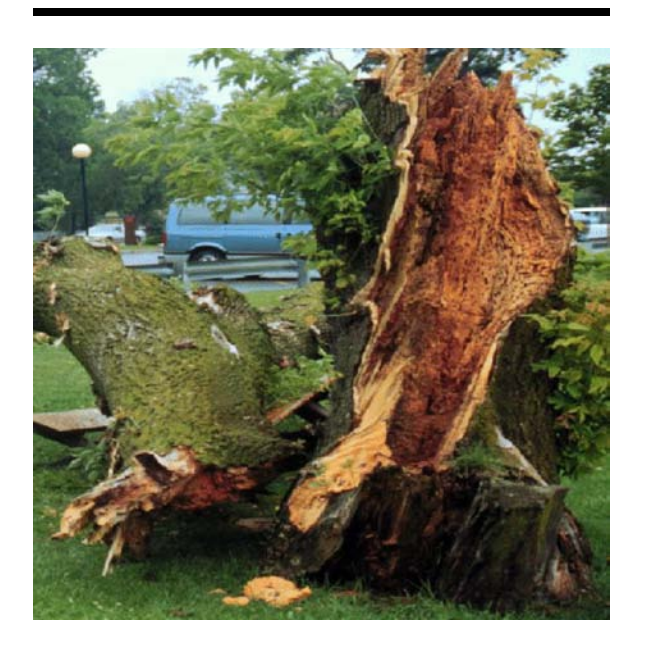
Figure 4. This seriously decayed tree should have been evaluated and removed before it failed.

• The thickness of sound wood is less than 1" for every 6" of diameter at any point on the stem.