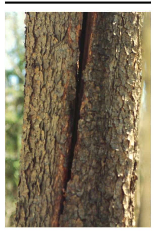
Figure 2. A serious crack like this one indicates that the tree is already failing!